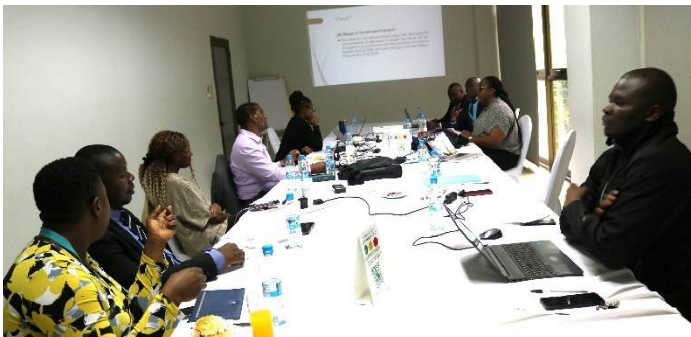
Participants during the validation of the Transport Policy and Procedures

pressed gratitude to officers from both ministries for their insightful contributions, which played a crucial role in developing a robust and practical framework for fleet management.