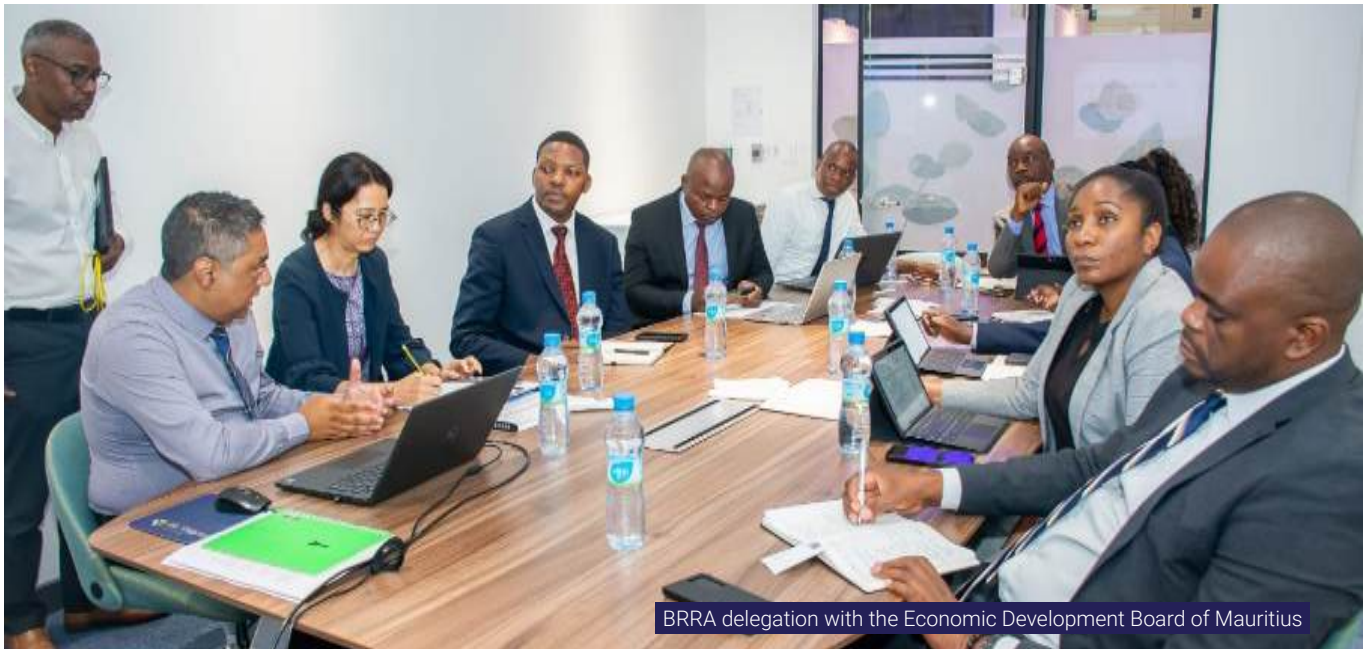
BRRR delegation with the Economic Development Board of Mauritius