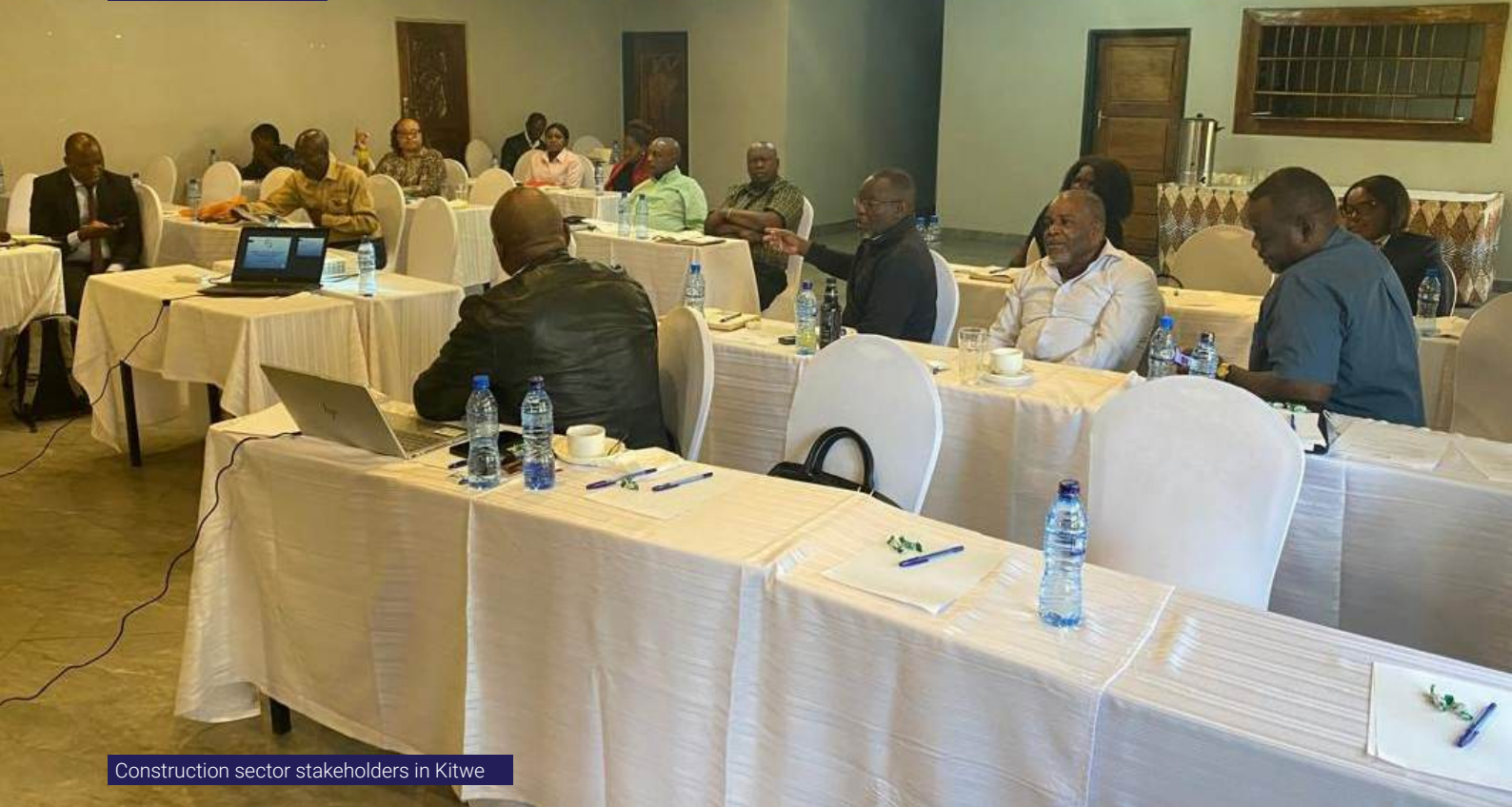
Construction sector stakeholders in Kitwe

itimate purpose and imposing the least burden and compliance costs on businesses are implemented. It also addresses duplications and streamlines cumbersome process-