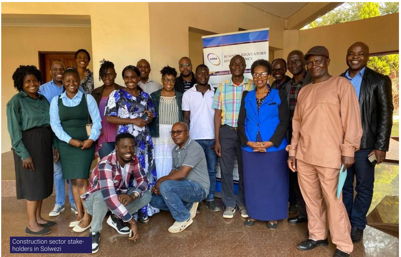
Construction sector stakeholders in Solwezi

saka, Namwala, Ndola and Solwezi will form an essential part of the RIA report on the sector.