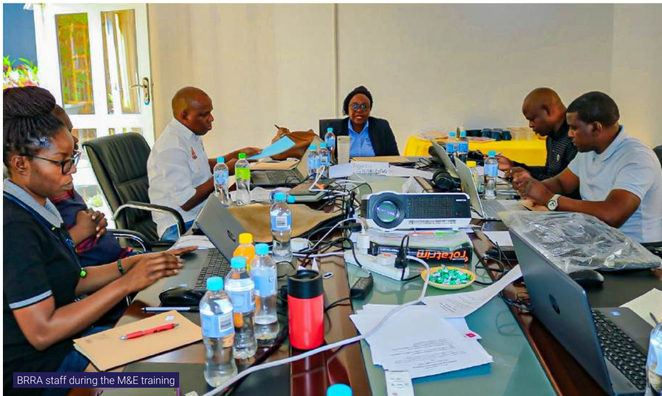
BARRA staff during the M&E training

The Business Regulatory Review Agency (BARRA) programme staff have successfully been trained in monitoring and evaluation (M&E). This initiative is aimed at equipping employees with the necessary skills to enhance the effectiveness of their work, particularly in tracking the progress of the Agency's various activities and programmes.